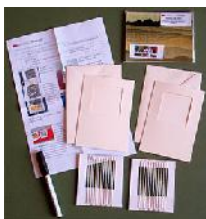
Inspiration Pack Design your own cards to send to those close to you