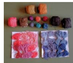
Yarn Treat Pack Lots of scope for including in other projects