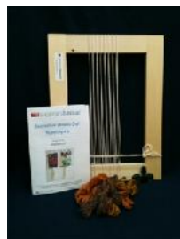
Children's tapestry Weaving Kit A delightful way to introduce tapestry weaving to the next generation