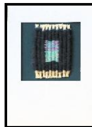
Handwoven Greeting Cards A delight to receive and treasure