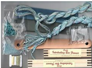
Tapestry Bead N Fibre Kits Intricate work but with a beautiful, wearable outcome.

All our gifts are beautifully presented, just ready for the giving. Here is a flavour of what they contain: