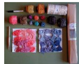
Weavers Golden Gift Pack This one has it all!