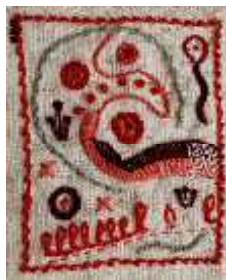
Free crewel work