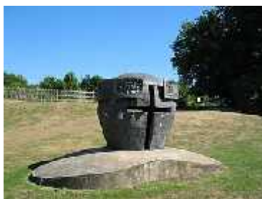
Monument to the Battle of Lewes

Very often the term 'tapestry' is applied to embroidered work rather than woven fabric – perhaps most famously in the case of the Bayeux Tapestry. In Lewes, Sussex, a specially designed (embroidered) tapestry is being stitched by local volunteers, to celebrate the battle's 750th anniversary in 2014. Based on drawings by Lewes artist Tom Walker, the tapestry will tell the story of the battle using ancient embroidering techniques. On completion it will hang in Barbican House Museum, Lewes. The project is part of a Heritage Lottery Funded celebration of The Battle of Lewes, led by Sussex Archaeological Society.