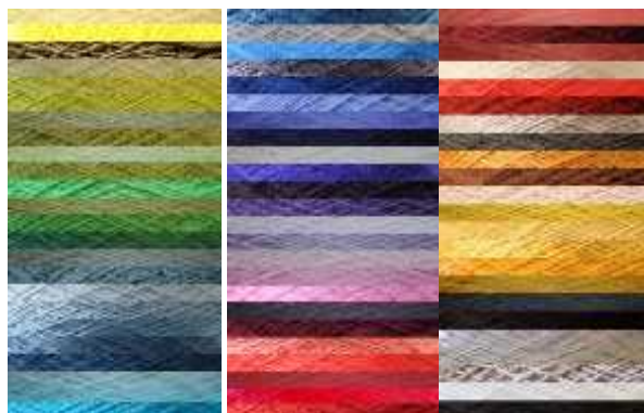
Palette Pack 1 Palette Pack 1 Palette Pack 1

The two Megabags have always been very popular, but with the increasing number of colours in our range it has become impossible to fit them all into just two collections. We have now created the Palette Packs : three colour packs which, between them, covers the full range in easily affordable collections. You can find them at http://www.weaversbazaar.com/product-list/palette-packs