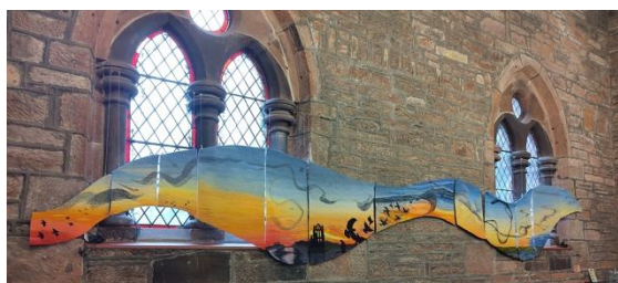
The Murmuration tapestries at The Usual Place, Dumfries, August 2025.

Alongside the exhibitions, there's a number of fascinating articles on Substack , including a series highlighting each weaver, the overall design process and more. There are also regular updates on Facebook and Instagram – links from Substack and the Nearly Wild Weaving website. The group gave an online talk about the project in October. It has been recorded and the link to watch it is on the Nearly Wild Weaving website .