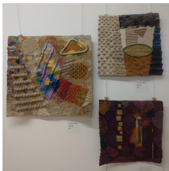
Examples of William Jefferies work at Threads in Sheds, Farfield Mill, 2022

There will be a programme of supporting events including workshops during the exhibition. See the Morley Gallery website for full details.