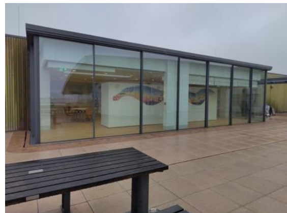
Murmuration at the Norfolk Wildlife Trust Visitor Centre, Cley Next the Sea, Norfolk, January / February 2026.

Plans are steadily coming together to show this project in the States, Canada and Mexico in 2027 / 28. If you have any suggestions for venues, and especially if you can help, please do get in touch with the Murmuration team!