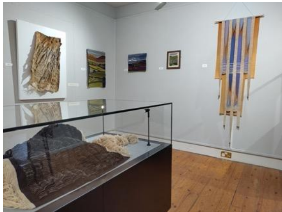
Tapestry of the North at Kirkleatham Museum.

The tapestries then go to the Bankfield Museum in Halifax from September for its final venue. See the Tapestry of the North website for details, including images of the work included in the exhibition.