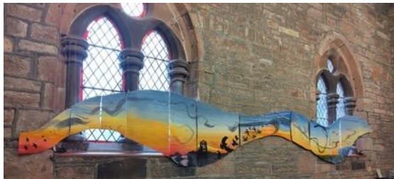
The Murmuration tapestries at The Usual Place, Dumfries, August 2025.

The catalogue for the Murmuration project is also available , price £15 plus p&p, and can be ordered online at https://square.link/u/yG6qYaGG .