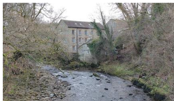
The view looking back from the bridge below Farfield Mill

Have a look at her website for workshop dates as well as how to contact her for one to one mentoring sessions.