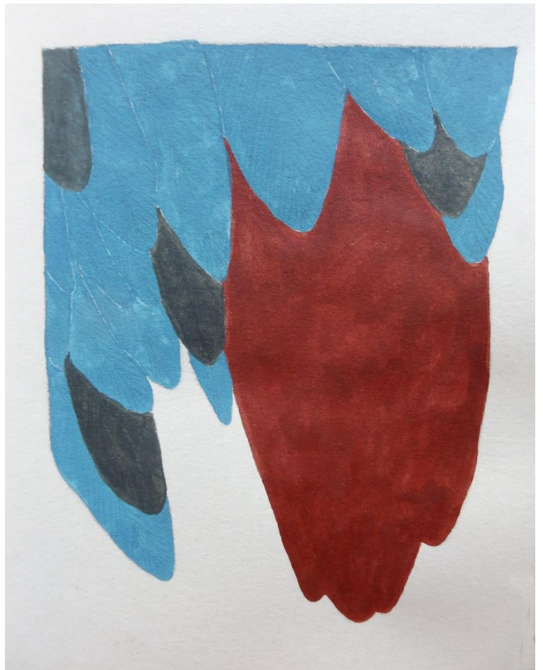
The Thing With Feathers, drawings, finished tapestry to be 102 x 79 cm variable = 40" x 31" variable

It is hard to know whether creating tapestries on this theme has helped with the grieving process. I knew I had to keep working, and that in itself must have helped. I am also lucky to be surrounded in Edinburgh by a community of tapestry weavers who are also friends. Their support through this trying time (as well as my dog and the allotment), together with my compulsion to keep creating have combined in a determination to keep on keeping on.