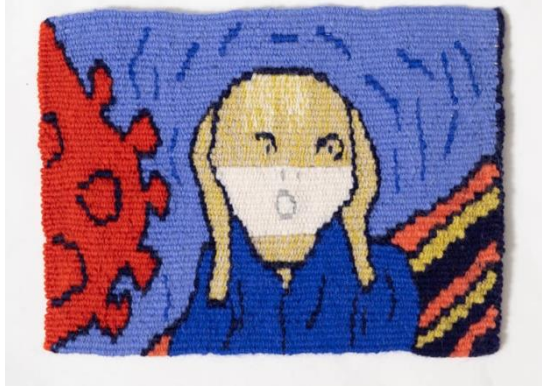
Covid Angst by Pip Barrington