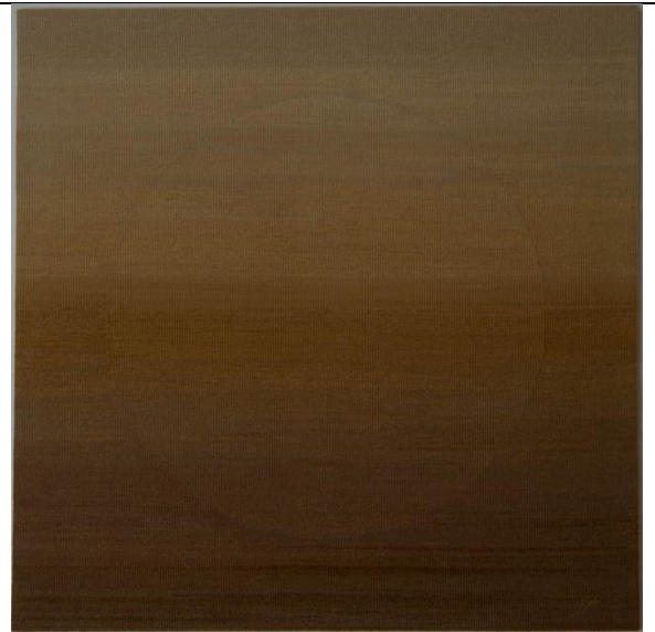
'Energy of earth' designed and woven by Soon Yul Kang