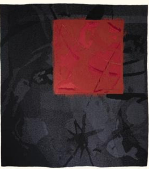
A recently completed large Diptych

Before I finish and close up the studio I put some yarn into soak as I have to do some dyeing tomorrow. My dyeing can be a bit intermittent at the best of times so I try to soak the yarn overnight with a bit of washing up liquid as wetting agent to make sure it is well and truly wet.