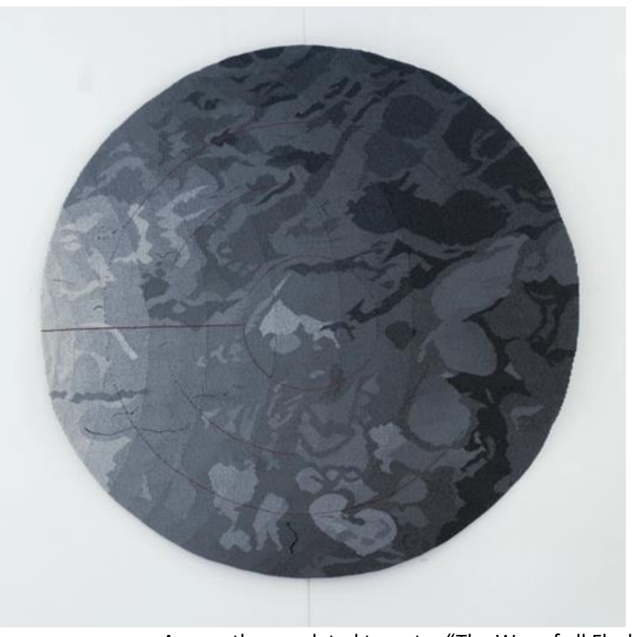
A recently completed tapestry "The Way of all Flesh"

Finally I can get on with some weaving in the studio, the studio is a room at the back of the house, originally built for the washing copper and storing coal. It is small and I have too much yarn in there as well as the scaffold and various other frames. I have used and warped looms when I did a few months contract at West Dean in the Tapestry Studio but returned to the simplicity of the scaffold frame. That doesn't mean I might not progress to a high warp loom in the future if I come across the right one, winding large work down is so much easier on a loom but I find warping up easier on a frame.